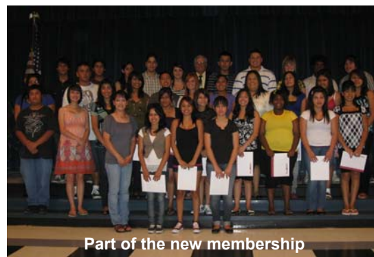
Part of the new membership