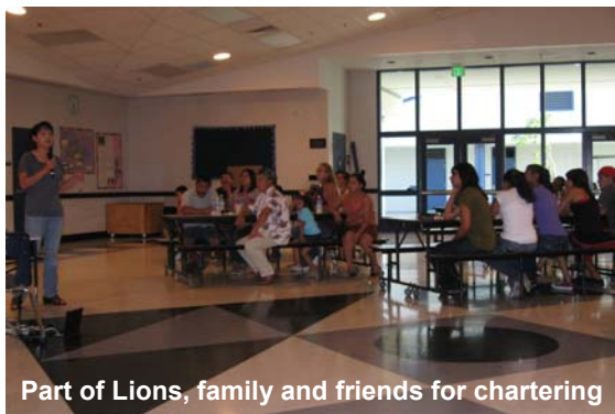
Part of Lions, family and friends for chartering