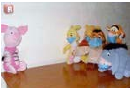
Swine Flu! (From the Web)

How else should we be fighting diabetes? Choices for healthy living should be as easy and accessible as fast food. Eating right and getting enough exercise is important for everyone, whether they have diabetes or not.” Parade Magazine , January 17, 2010, page 10. ●