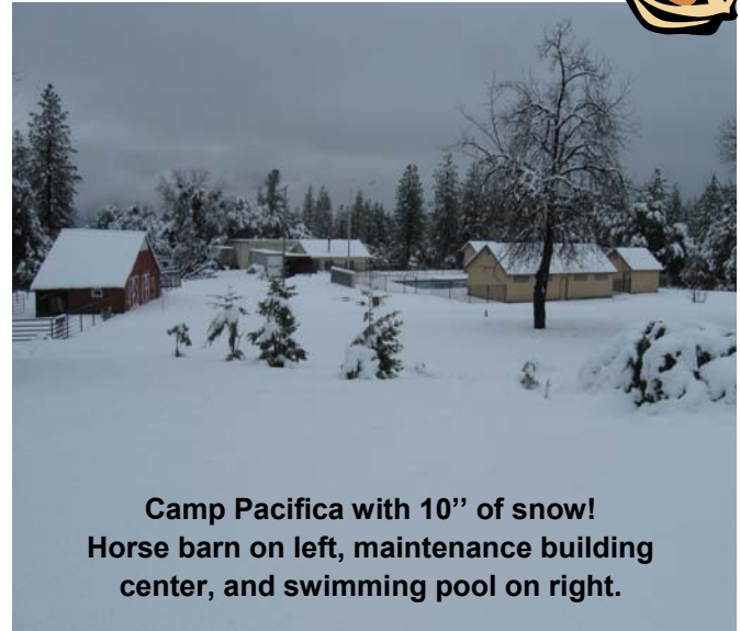
Camp Pacifica with 10" of snow! Horse barn on left, maintenance building center, and swimming pool on right.

California Lions Camp, Camp Pacifica celebrated 31 years of providing an exciting outdoor experience for deaf and hard of hearing children. The camp sessions were filled with enthusiastic counselors and energetic campers. We have many campers, who return year after year because they enjoy the camp so much. Also we have many new campers.